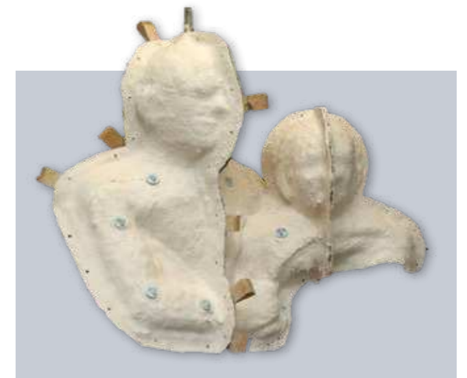
Support moulds made of ebacryl laminate system