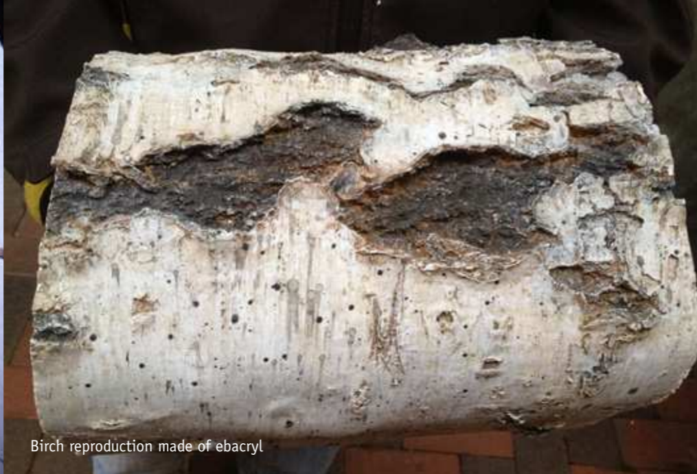
Birch reproduction made of ebacryl