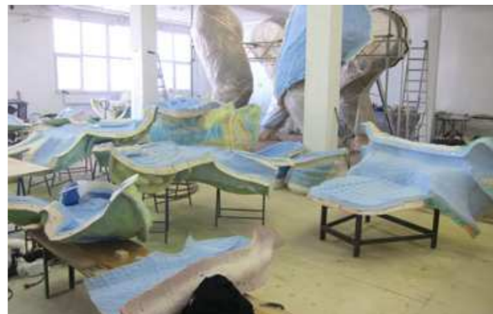
ebacryl production moulds for the dragon skin, which was made of ebalta epoxy resin AH 140

ebacryl is water-based and ecologically compatible, environmentally friendly, and low in odour. The tools can be cleaned with water. ebacryl complies with the fire regulations of class B1 and is therefore very well suited, for example, for scenery construction.