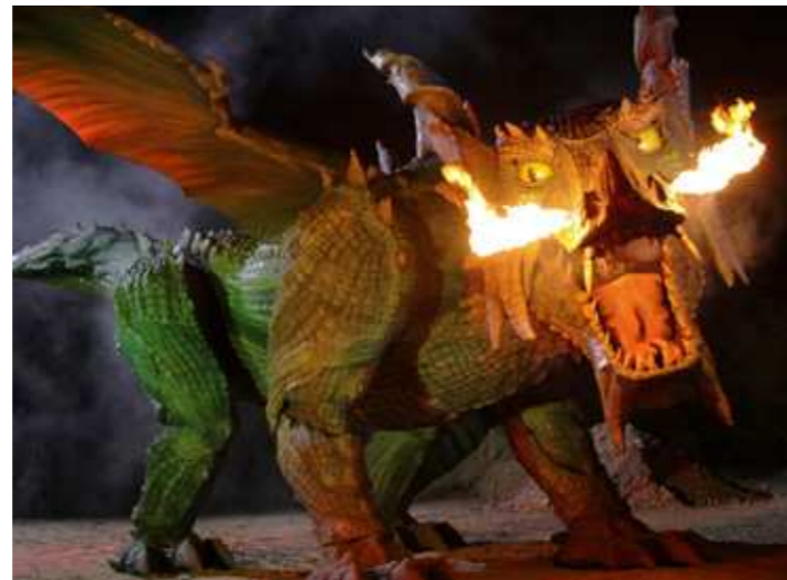
The fireproof dragon head is laminated with ebalta epoxy resin LH 25 (fireproof certificated)

For example, for moulding and producing the dragon skin of Tradinno. With about 16 m length the fire dragon from Furth im Wald is listed in the Guinness Book of records as the world largest walking robot.