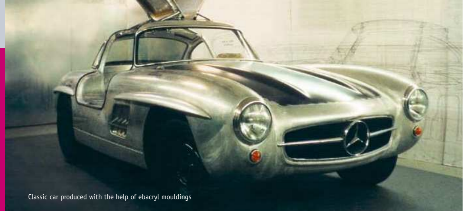
Classic car produced with the help of ebacryl mouldings