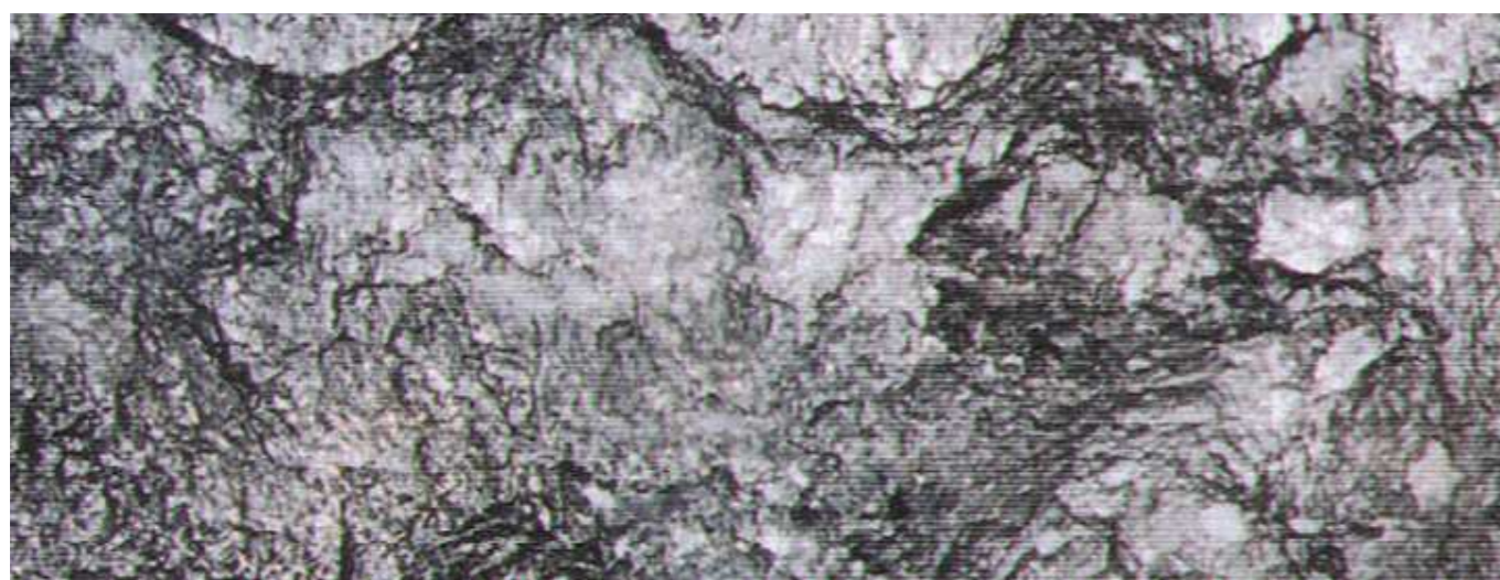
Detail of a coal wall replica made of ebacryl