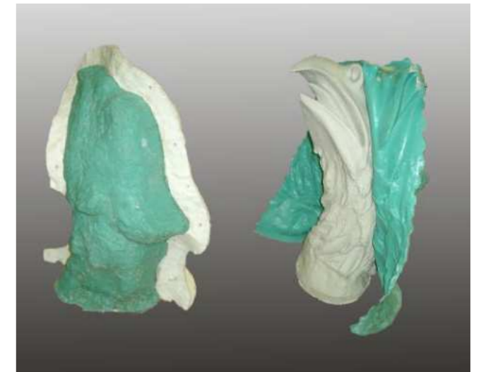
Plaster reproduction made in ebacryl support mould and silicone skin