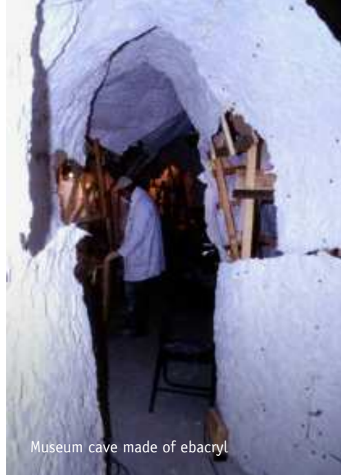
Museum cave made of ebacryl